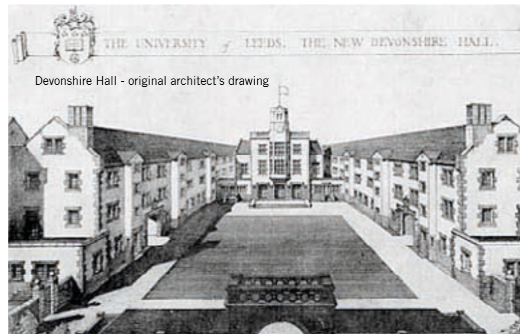
Devonshire Hall - original architect's drawing

Headingley has a nightlife that is an exciting and vibrant offering a host of trendy bars including The Arc, The Box, and Trio are all conveniently scattered across Headingley– all of which are completely geared up for people seeking a good night outside of the city centre. Trio focuses on quality food and cocktails, The Box has more of a sports bar vibe and screens most major fixtures, whilst The Arc is more suitable for those fancying a little boogie.