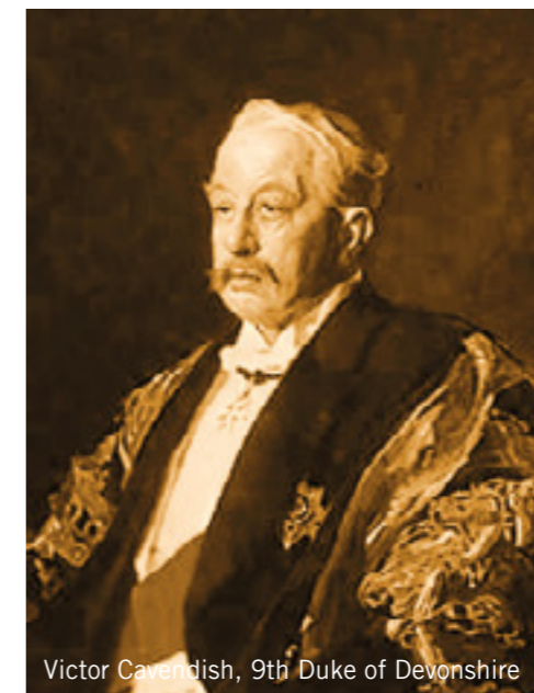
Victor Cavendish, 9th Duke of Devonshire

The Oxbridge style building is located within a short walking distance of a range of shops, bars and coffee bars, hairdressers and mini-supermarkets (including Sainsbury's and Wilkinsons). The Majority of these shops can be located within the Arndale centre a short